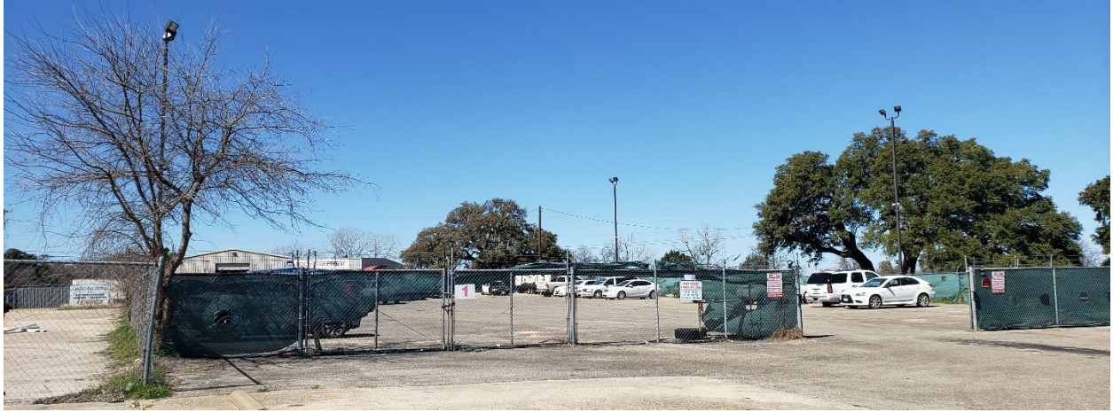
Fig. 7. Date- 23 February 2024. Impound Lot just north of desired building. Of note is the fabric used to provide shielding.