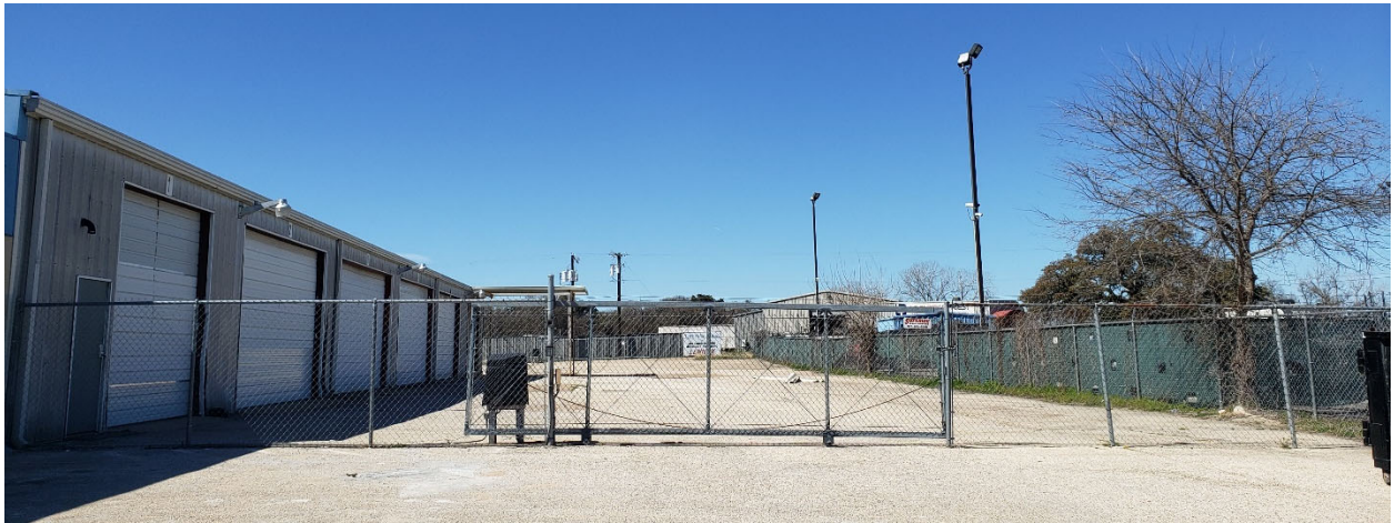
Fig. 6. Date- 23 February 2024. View from Kegley Road closer in. Note green fabric on impound lot.