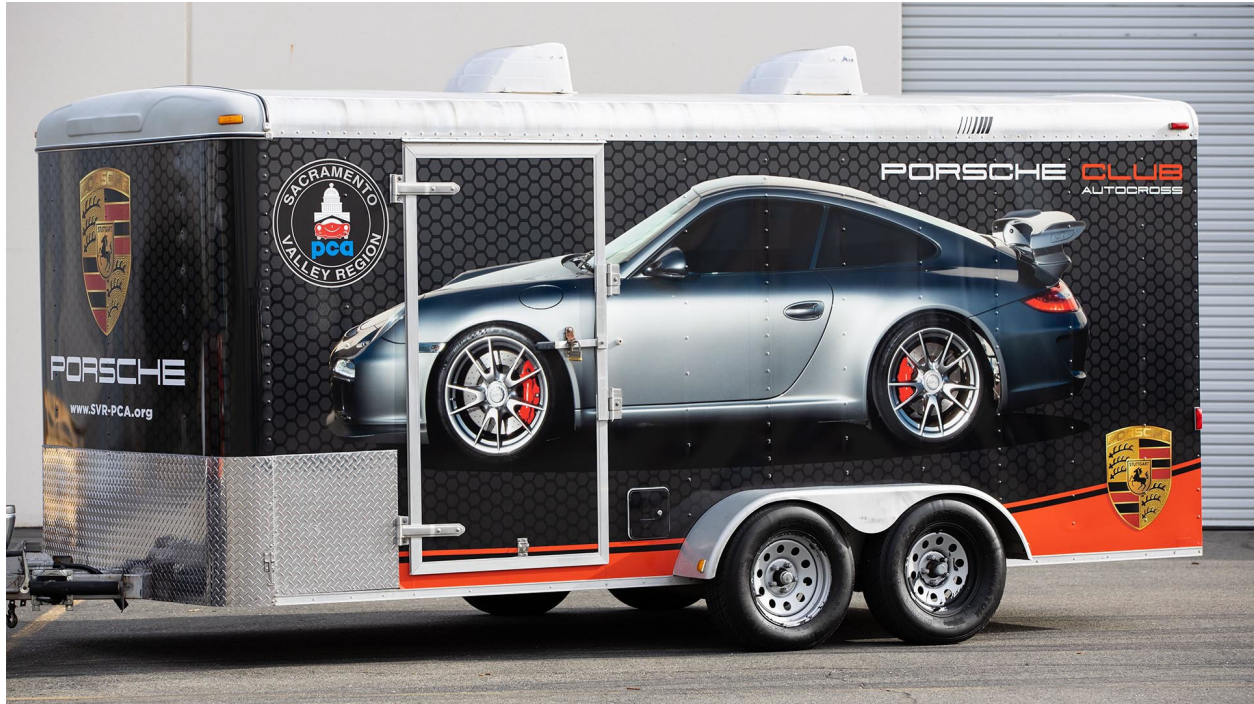
Fig. 9. Example of an enclosed trailer for taking vehicles to events. These trailers are regularly 6'11" which is still under the height of a typical FedEx truck and significantly lower than semi-truck trailers of 13' which have been stored on site. See www.trailex.com for example enclosed trailers.