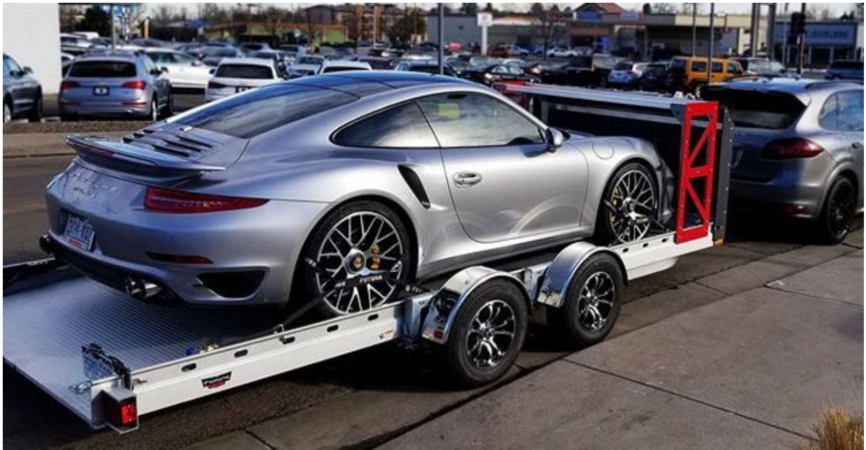
Fig. 8. Example of open-air trailer used for transporting vehicles. For comparison, FedEx vehicles' height range from 7' to 10' overall height and semi-truck trailers are 13' tall and are much taller than these trailers.