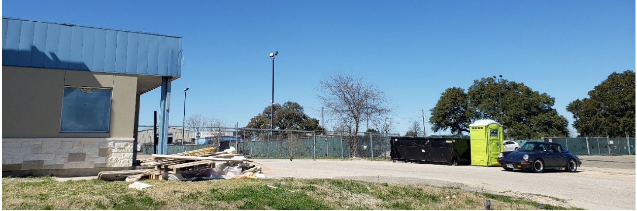
Fig. 5. Date- 23 February 2024. View from Kegley Road looking Northwest towards impound lot.