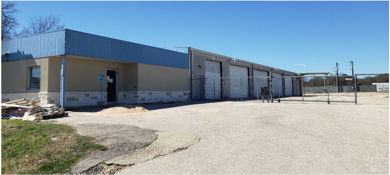
Fig. 3. Date- 23 Feb 2024. View from Kegley Road looking West. Kegley Road is below the parking lot site and therefore the angle of view helps to obscure vehicles and trailers behind a covered fence.