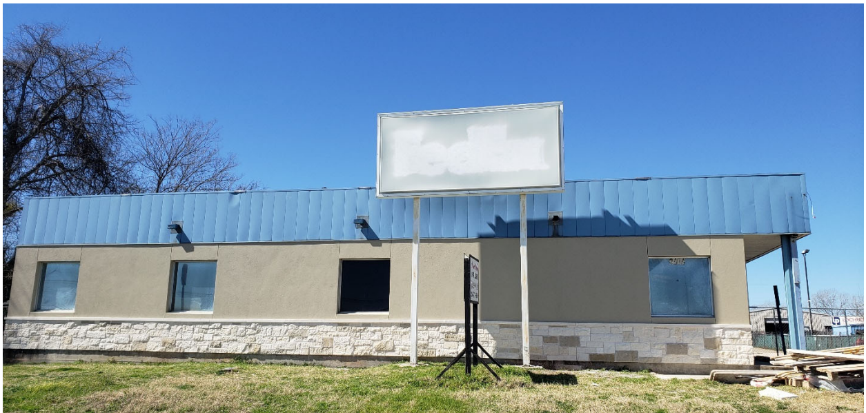
Fig. 4. Date- 23 Feb 2024. View from Kegley Road looking West.