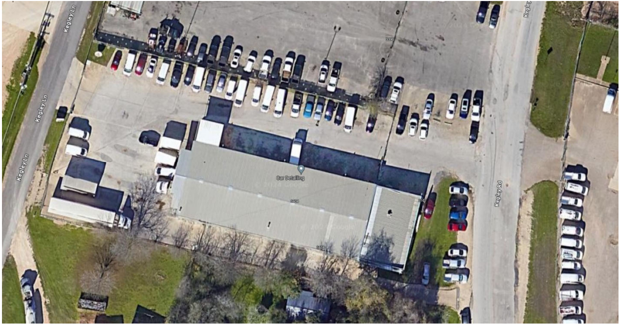
Fig. 1. Satellite view from Google Maps showing some storage of vehicles previously stored there and the impound lot to the North. Across the street is InHouse Systems and their vehicles.