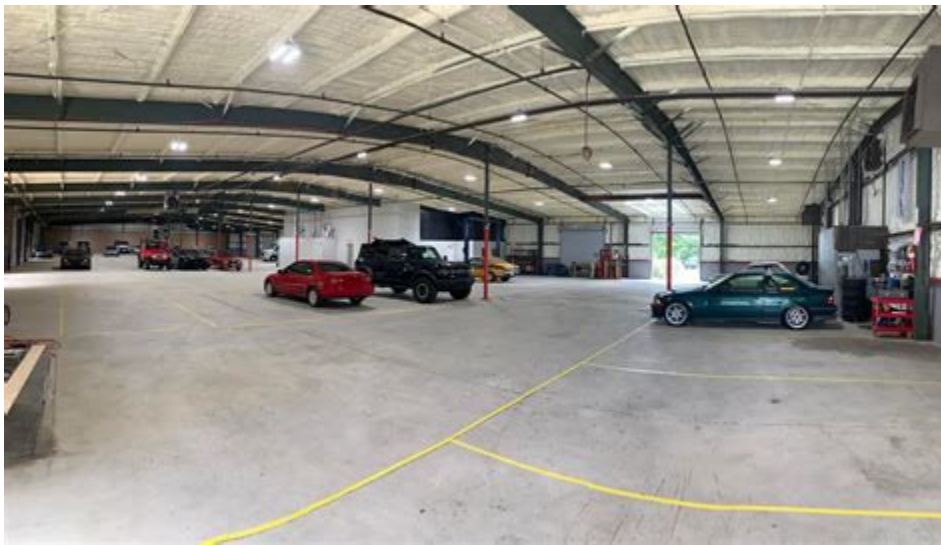
Fig. 10. Interior of e3 Storage Marietta facility. Exteriors are usually not publicized or promoted to discourage theft. This goes to the extent that Google Maps is requested not to have the facility on their maps along with pictures to preserve the club members' privacy.