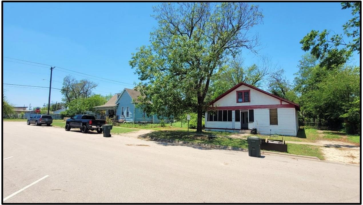
Facing west from S 9 th St showing adjacent homes