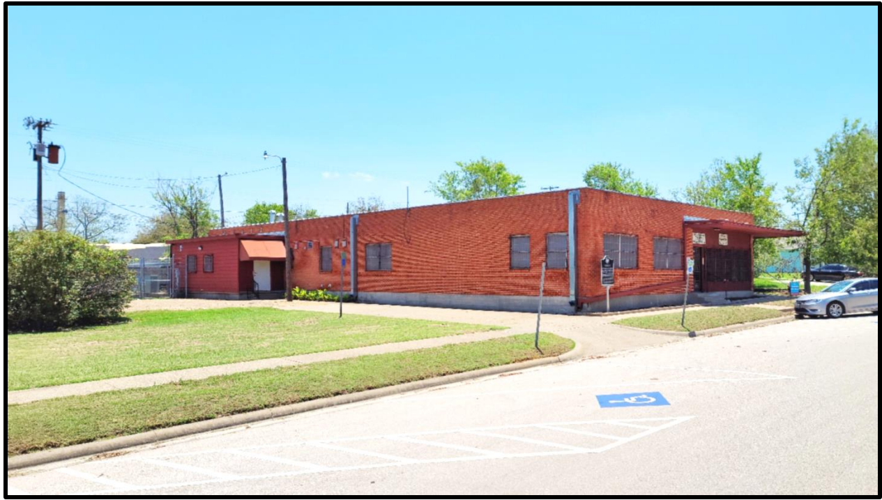
Facing southeast from S 9 th St towards subject property