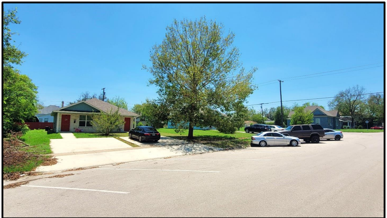
Facing southeast along S 9 th St showing adjacent homes